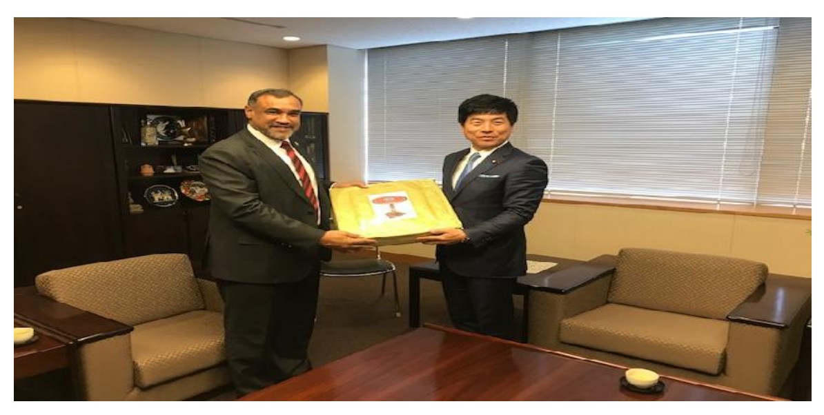
Call on Mr. Kazuyuki NAKANE State Minister for Foreign Affairs

Lt. General Javed Mahmood Bukhari, Quarter Master General of Pakistan Army visited Japan from 26<sup>th</sup> February to 05<sup>th</sup> March 2018 and held meetings with various Government functionaries of Japanese Government. During the meeting matters of mutual interest were discussed besides stressing upon efforts to further strengthen bilateral cooperation in the defence forces between the two countries.