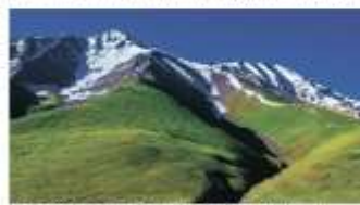
The Hindu Valley, adjacent to Deosai National Park in the western Himalayas in the Gilg-Baltistan, is a popular tourist spot known for its scenic views and many lakes.