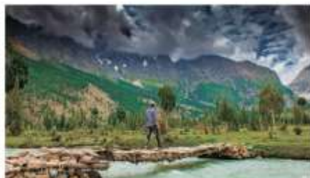
The Hindu Valley near Skardu in the Gilg-Baltistan region is covered with lush evergreen forests of pine, juniper and other tree species.

Japan is also one of Pakistan's key partners in the fields of education, management,