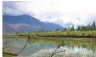
Left: Scenic Katpanah Lake in the midst of a high-altitude desert in the Gilg-Baltistan region. Right: A hiker poses in front of Mount Rakaposhi, a formidable peak in the Karakoram range.

My prosperity continue to reign in Pakistan.