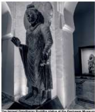
The largest Gandharan Buddha statue at the Peshawar Museum