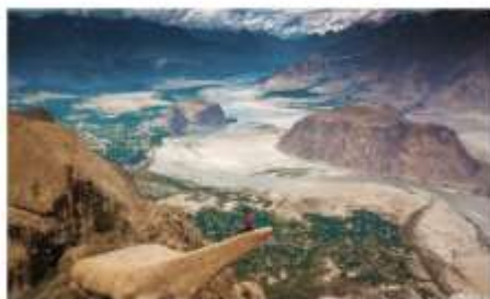
A hiker poses in front of Mount Rakaposhi, a 7,666-meter geological sacred in the Hindu Valley near Skardu that has become a tourist draw in recent years.

Long live Pakistan-Japan friendship! This content was compiled in collaboration with the embassy. The views expressed here do not necessarily reflect those of the newspaper.