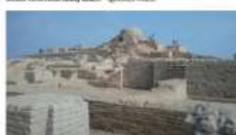
The Hindu Valley Civilization was one of the world's earliest developed civilizations about 5,500 years ago. Situated on the banks of the Indus River, the remains of the Harappan and Kot Diji urban groups belong to this great civilization.