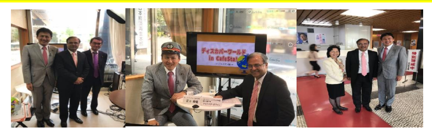
Mr. Takei Syunsuke member of House of Representative from LDP conducted an interview of Ambassador Khan for "Discover the World in Cafesta". Foreign Minister Taro Kono and Former Minister of Justice Matsushima Midori Sensei also dropped in during the interview to meet the Ambassador