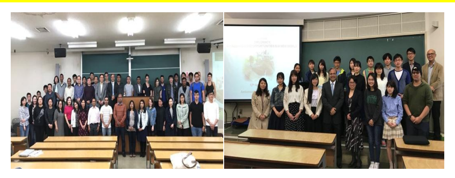
The Ambassador visited Kyushu University and spoke to LLM and Undergraduate students