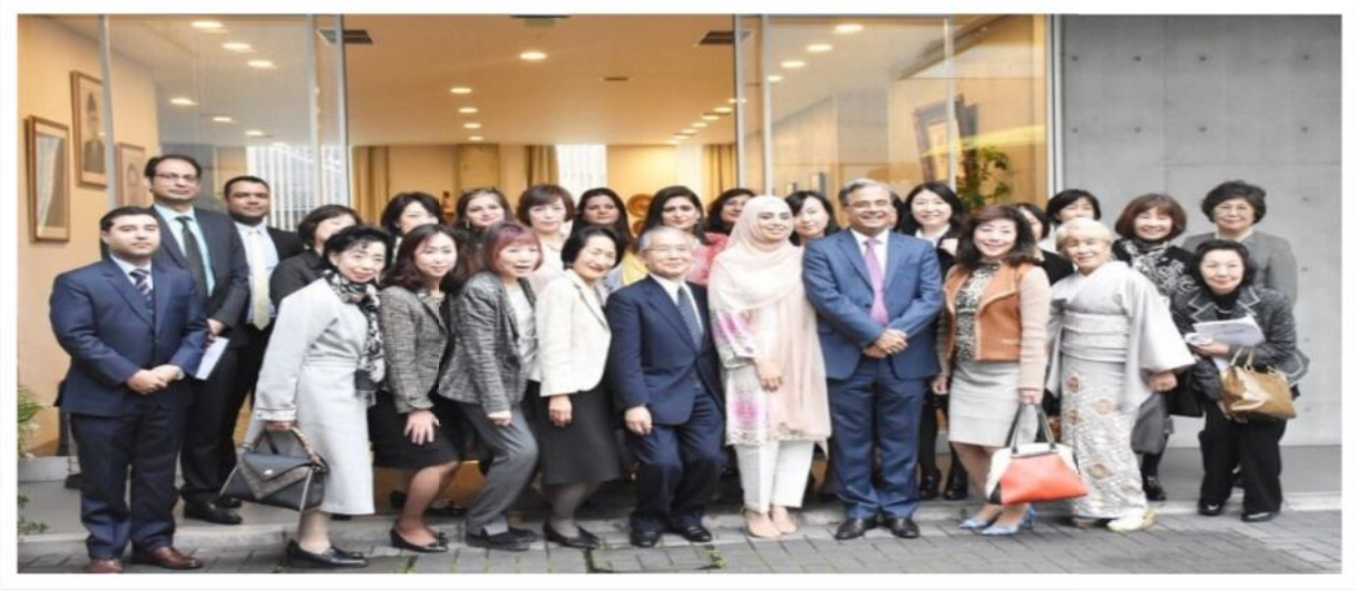
Received International Friendship Exchange Council delegation at the Embassy, given a comprehensive presentation on Pakistan